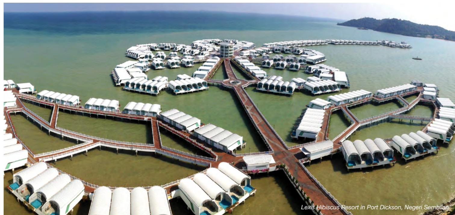
Lexis Hibiscus Resort in Port Dickson, Negeri Sembilan

The company's core value in delivering quality products and solutions are evident in them utilizing only premium quality materials such as Clean COLORBOND®, ZINCALUME®, Pure Titanium, Titanium Zinc, Copper, Aluminium and Stainless Steel.