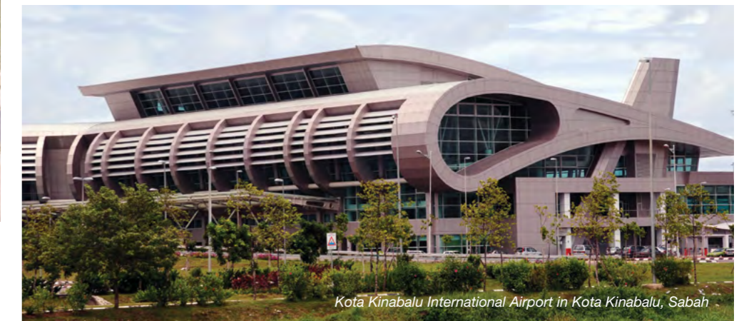
Kota Kinabalu International Airport in Kota Kinabalu, Sabah