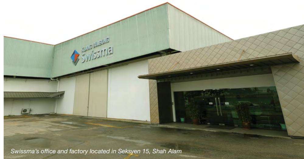
Swissma's office and factory located in Seksyen 15, Shah Alam

Swissma Building Technologies Sdn Bhd was established with the expertise of European master-craftsmen and incorporation of European technologies, poised in providing high-end premium roofing and wall cladding system in Malaysia. Swissma together with its partners Sanko Metal Industries Co. Ltd (Japan) and Nippon Steel & Sumikin Bussan Corporation (Japan) provides total solution for roofing and wall cladding in terms of design, fabrication and installation. Swissma's Sanko range of metal roof has a proven track record in Malaysia since 1974, supplying