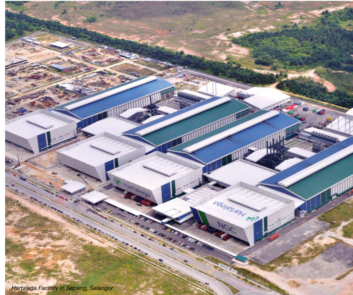
Hartalega Factory in Sepang, Selangor

Swissma's total solutions are able to cater to all design requirements including buildings of three dimensional shapes, industrial buildings that require long length metal roof installation, residential homes, airports, institutional and commercial buildings. Their forte is the ability to provide value engineering to meet both technical and budgetary requirements.