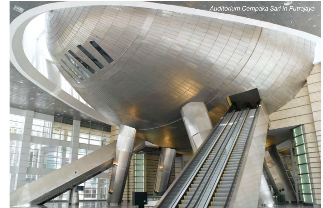
Auditorium Cempaka Sari in Putrajaya